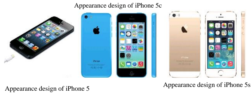
Figure 2. The appearance design drawings of three kinds of products of Apple Inc, respectively iPhone 5, iPhone 5 and iPhone 5s.

Front--the front appearance is the primitive with regular square, arc streamline is shown at the corner, the overall round dial operating button is designed to be clean and neat.